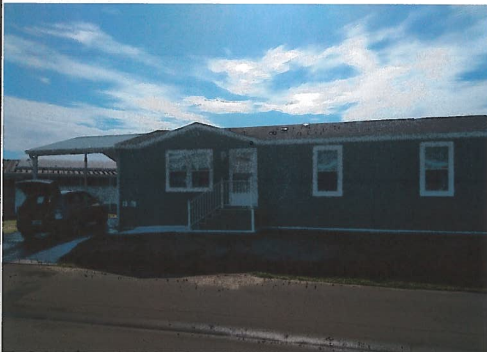
Photo One Caption FRONT

If using the Elevation Certificate to obtain NFIP flood insurance, affix at least 2 building photographs below according to the instructions for Item A6. Identify all photographs with date taken; "Front View" and "Rear View"; and, if required, "Right Side View" and "Left Side View." When applicable, photographs must show the foundation with representative examples of the flood openings or vents, as indicated in Section A8. If submitting more photographs than will fit on this page, use the Continuation Page.