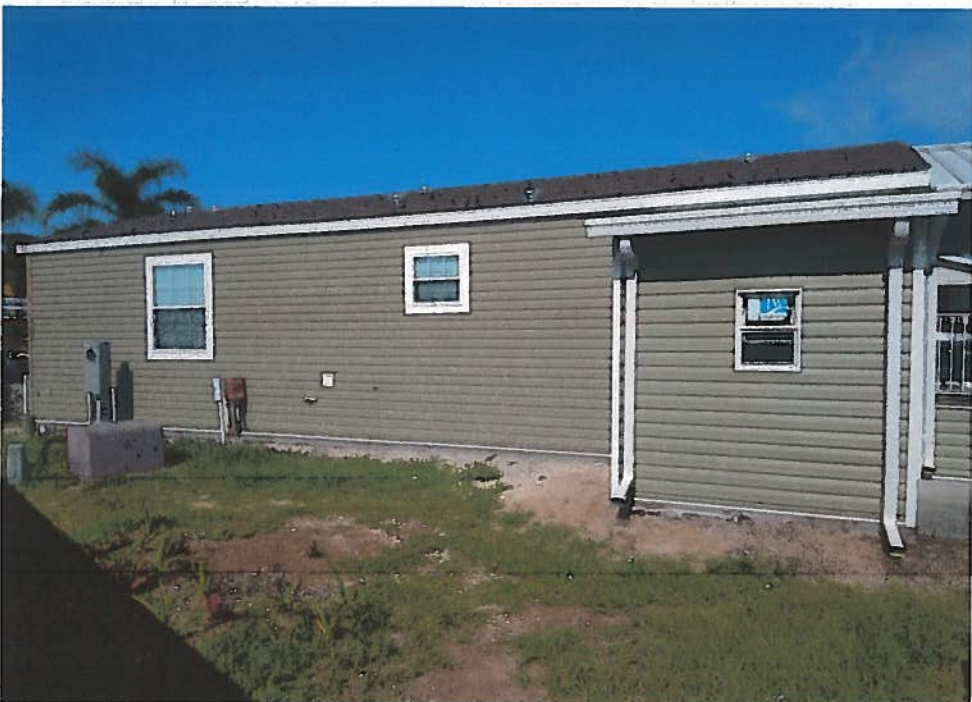
Photo Two Caption BACK