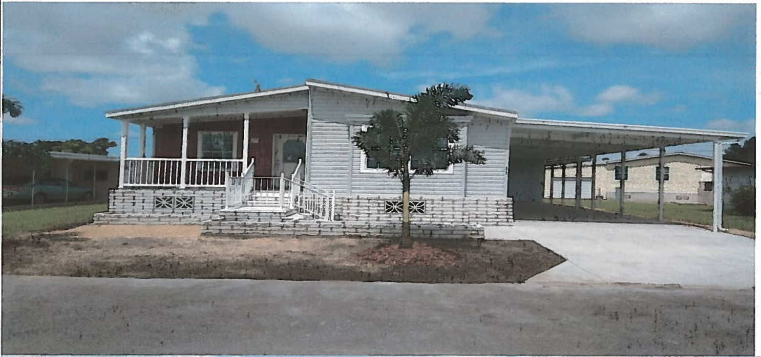
Photo One Caption FRONT

If using the Elevation Certificate to obtain NFIP flood insurance, affix at least 2 building photographs below according to the instructions for Item A6. Identify all photographs with date taken; "Front View" and "Rear View"; and, if required, "Right Side View" and "Left Side View." When applicable, photographs must show the foundation with representative examples of the flood openings or vents, as indicated in Section A8. If submitting more photographs than will fit on this page, use the Continuation Page.