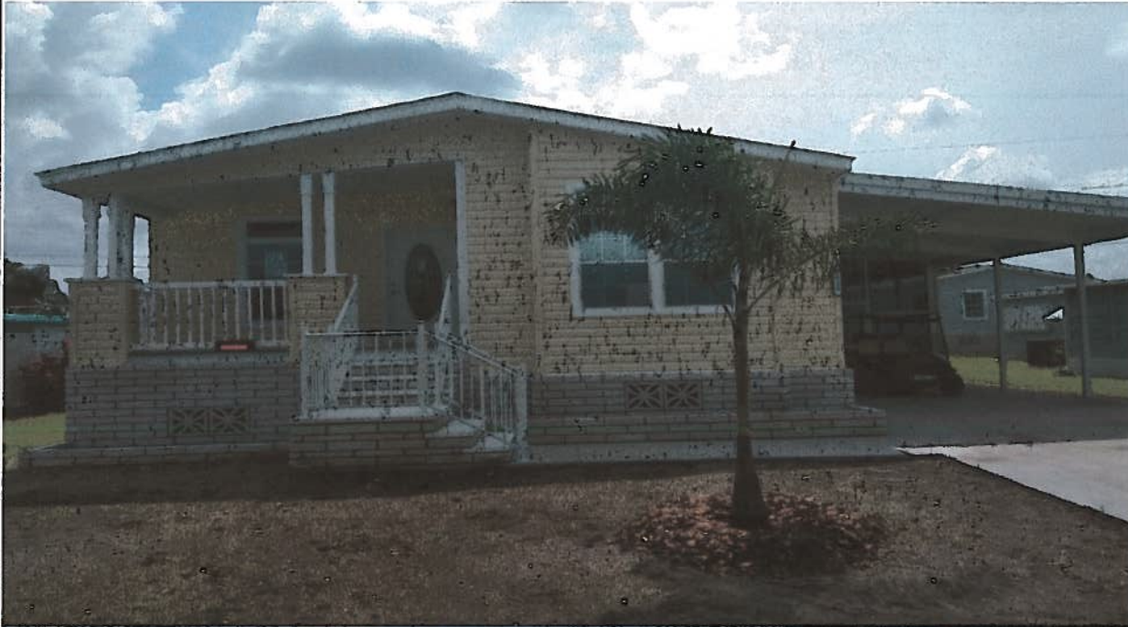
Photo One Caption FRONT

If using the Elevation Certificate to obtain NFIP flood insurance, affix at least 2 building photographs below according to the instructions for Item A6. Identify all photographs with date taken; "Front View" and "Rear View"; and, if required, "Right Side View" and "Left Side View." When applicable, photographs must show the foundation with representative examples of the flood openings or vents, as indicated in Section A8. If submitting more photographs than will fit on this page, use the Continuation Page.