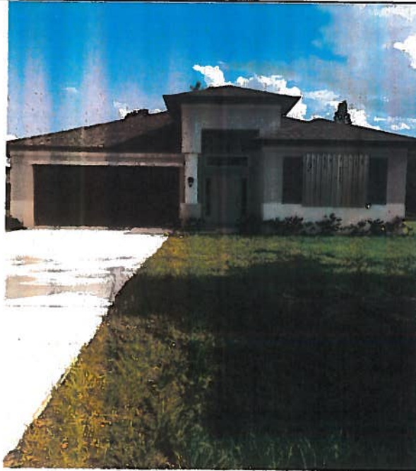
FRONT VIEW 09/21/17

If using the Elevation Certificate to obtain NFIP flood insurance, affix at least 2 building photographs below according to the instructions for Item A6. Identify all photographs with date taken; "Front View" and "Rear View"; and, if required, "Right Side View" and "Left Side View." When applicable, photographs must show the foundation with representative examples of the flood openings or vents, as indicated in Section A8. If submitting more photographs than will fit on this page, use the Continuation Page.