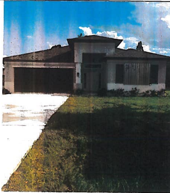
FRONT VIEW 09/21/17

If using the Elevation Certificate to obtain NFIP flood insurance, affix at least 2 building photographs below according to the instructions for Item A6. Identify all photographs with date taken; "Front View" and "Rear View"; and, if required, "Right Side View" and "Left Side View." When applicable, photographs must show the foundation with representative examples of the flood openings or vents, as indicated in Section A8. If submitting more photographs than will fit on this page, use the Continuation Page.