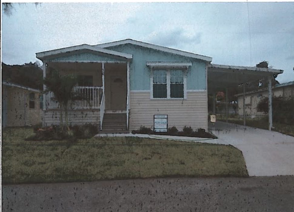
Photo One Caption FRONT

If using the Elevation Certificate to obtain NFIP flood insurance, affix at least 2 building photographs below according to the instructions for Item A6. Identify all photographs with date taken; "Front View" and "Rear View"; and, if required, "Right Side View" and "Left Side View." When applicable, photographs must show the foundation with representative examples of the flood openings or vents, as indicated in Section A8. If submitting more photographs than will fit on this page, use the Continuation Page.