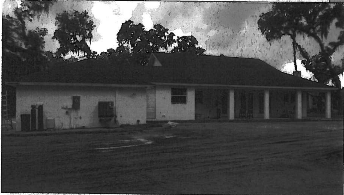
REAR VIEW 11-20-2018