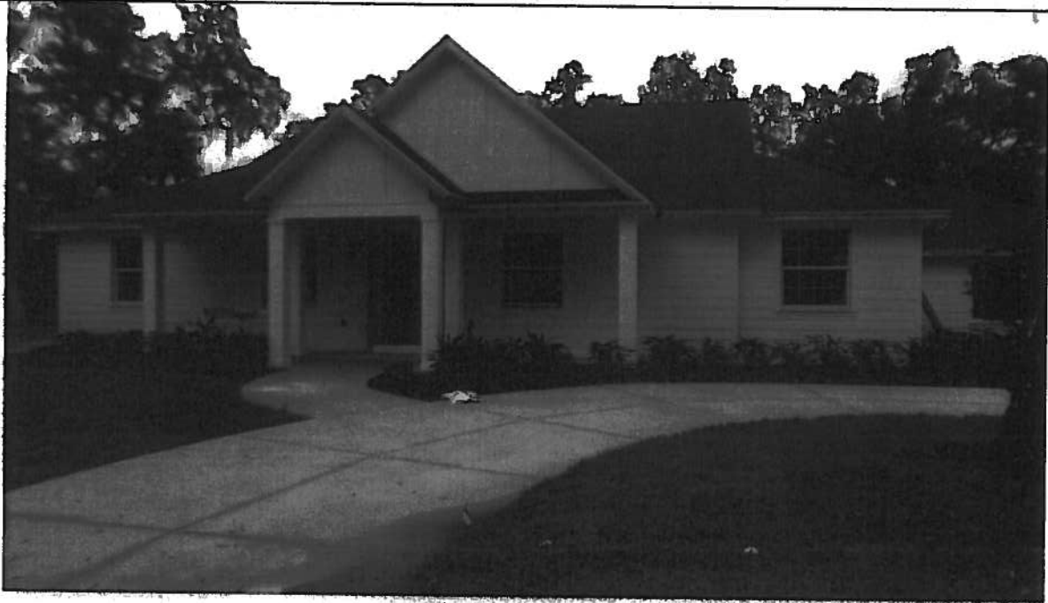
FRONT VIEW 11-20-2018

If using the Elevation Certificate to obtain NFIP flood insurance, affix at least 2 building photographs below according to the instructions for Item A6. Identify all photographs with date taken; "Front View" and "Rear View"; and, if required, "Right Side View" and "Left Side View." When applicable, photographs must show the foundation with representative examples of the flood openings or vents, as indicated in Section A6. If submitting more photographs than will fit on this page, use the Continuation Page.