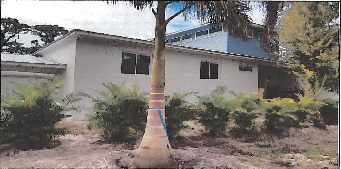
Photo One Caption Front View - 3910 Elysian Woods Lane

If using the Elevation Certificate to obtain NFIP flood insurance, affix at least 2 building photographs below according to the instructions for Item A6. Identify all photographs with date taken; "Front View" and "Rear View"; and, if required, "Right Side View" and "Left Side View." When applicable, photographs must show the foundation with representative examples of the flood openings or vents, as indicated in Section A8. If submitting more photographs than will fit on this page, use the Continuation Page.