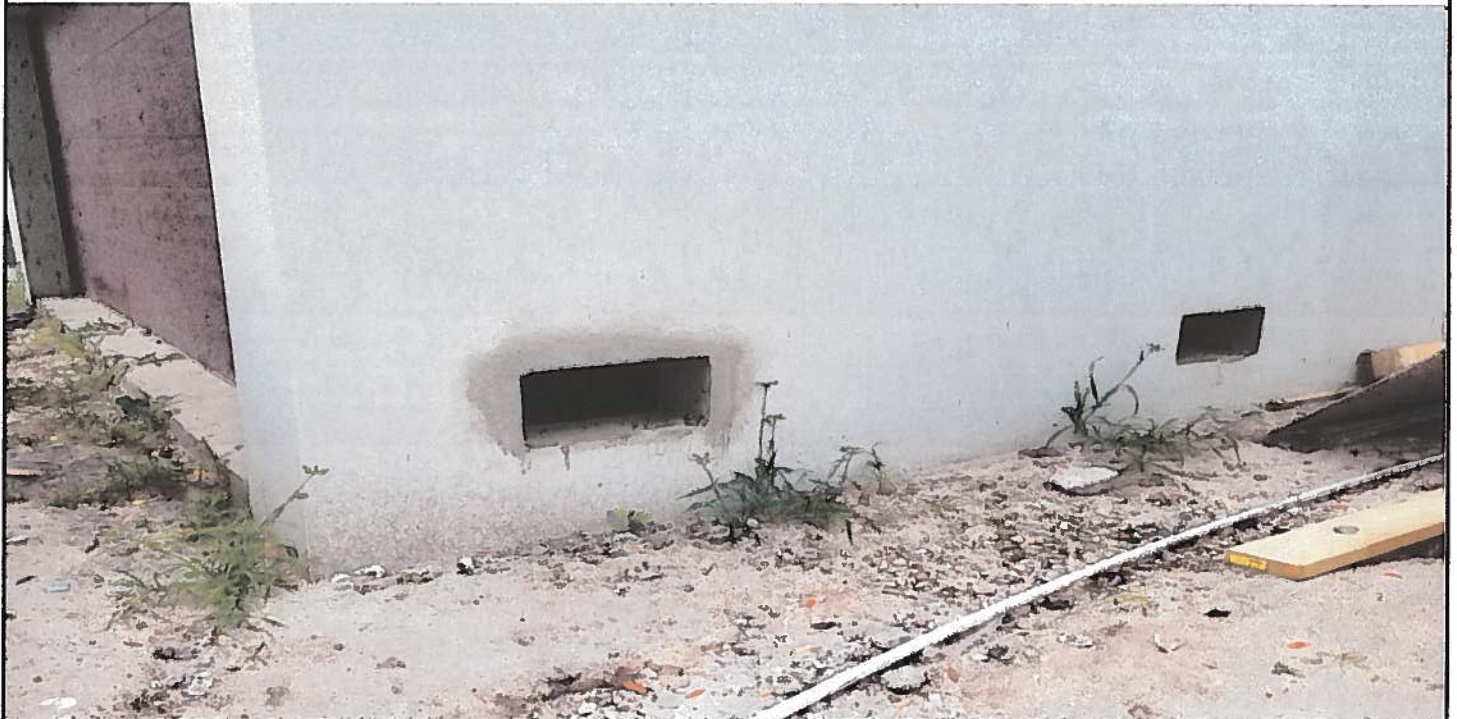
Photo One Caption Vent photo - 3910 Elysian Woods Lane

If submitting more photographs than will fit on the preceding page, affix the additional photographs below. Identify all photographs with: date taken; "Front View" and "Rear View"; and, if required, "Right Side View" and "Left Side View." When applicable, photographs must show the foundation with representative examples of the flood openings or vents, as indicated in Section A8.