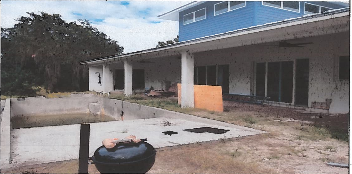
Photo Two Caption Rear View - 3910 Elysian Woods Lane