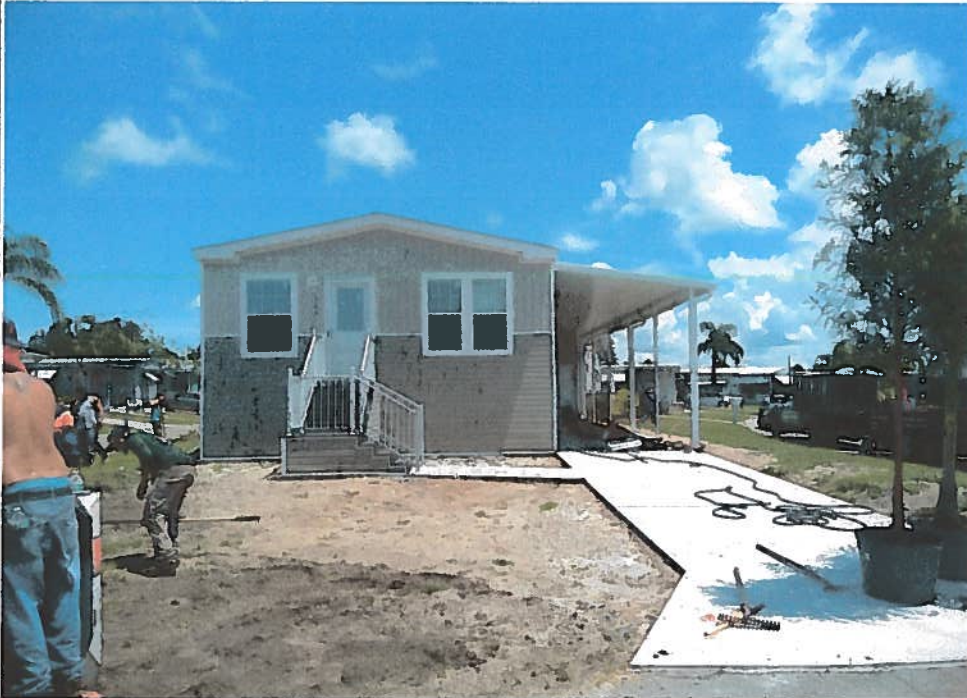
Photo One Caption FRONT

If using the Elevation Certificate to obtain NFIP flood insurance, affix at least 2 building photographs below according to the instructions for Item A6. Identify all photographs with date taken; "Front View" and "Rear View"; and, if required, "Right Side View" and "Left Side View." When applicable, photographs must show the foundation with representative examples of the flood openings or vents, as indicated in Section A8. If submitting more photographs than will fit on this page, use the Continuation Page.