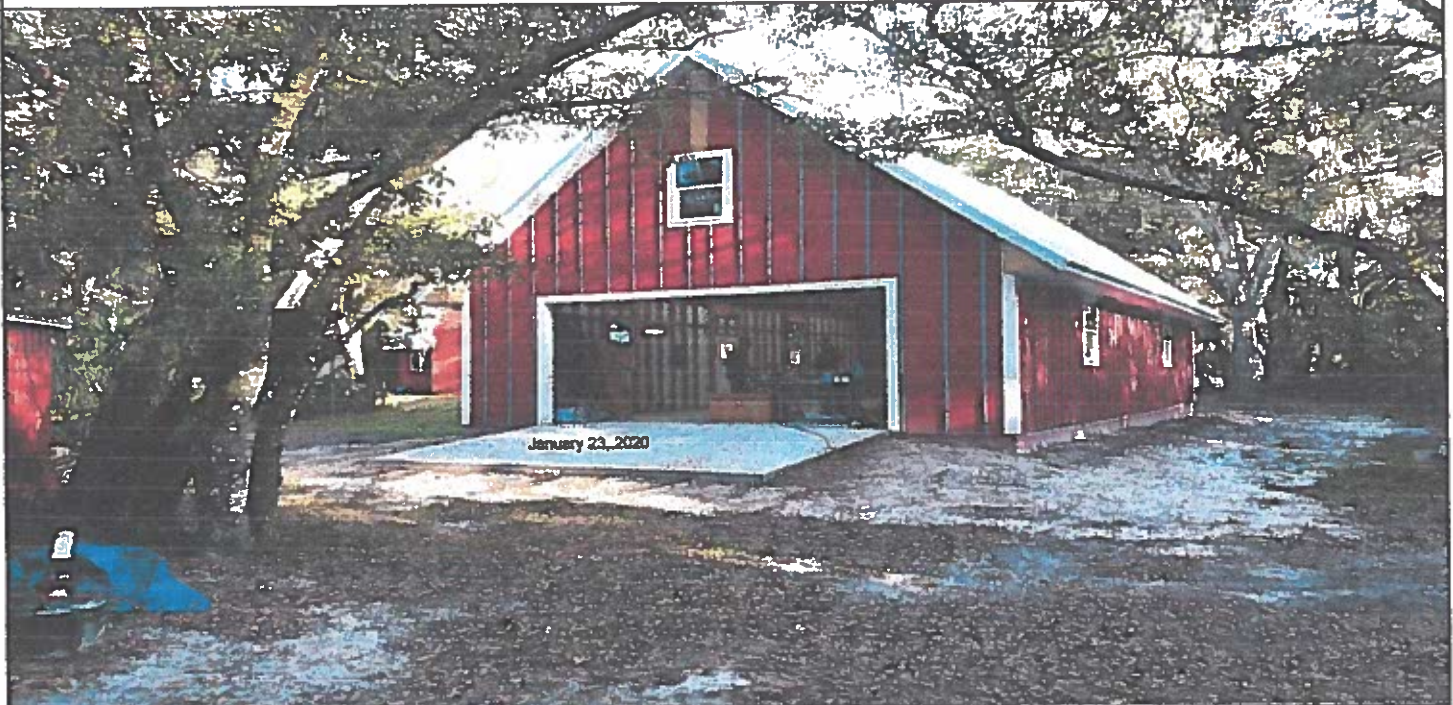
Photo One Caption Front view

If using the Elevation Certificate to obtain NFIP flood insurance, affix at least 2 building photographs below according to the instructions for Item A6. Identify all photographs with date taken; "Front View" and "Rear View"; and, if required, "Right Side View" and "Left Side View." When applicable, photographs must show the foundation with representative examples of the flood openings or vents, as indicated in Section A8. If submitting more photographs than will fit on this page, use the Continuation Page.