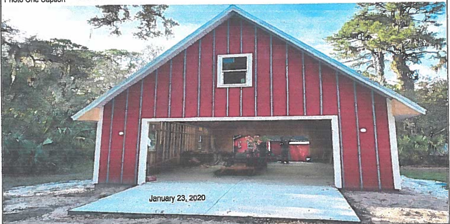
Photo Two Caption Rear view