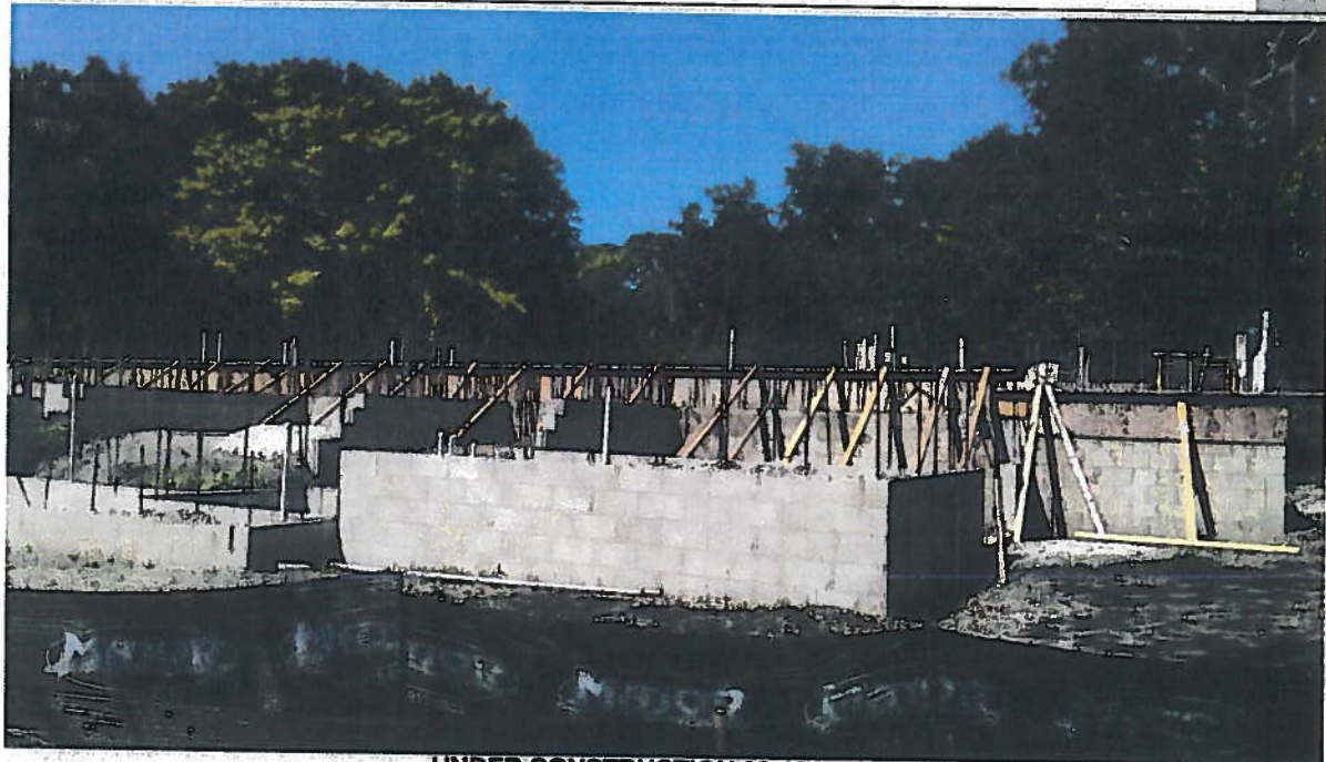
UNDER CONSTRUCTION 08-10-2020