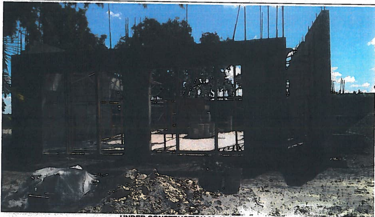
UNDER CONSTRUCTION 08-10-2020

If using the Elevation Certificate to obtain NFIP flood insurance, affix at least 2 building photographs below according to the instructions for Item A6. Identify all photographs with date taken; "Front View" and "Rear View"; and, if required, "Right Side View" and "Left Side View." When applicable, photographs must show the foundation with representative examples of the flood openings or vents, as indicated in Section A8. If submitting more photographs than will fit on this page, use the Continuation Page.