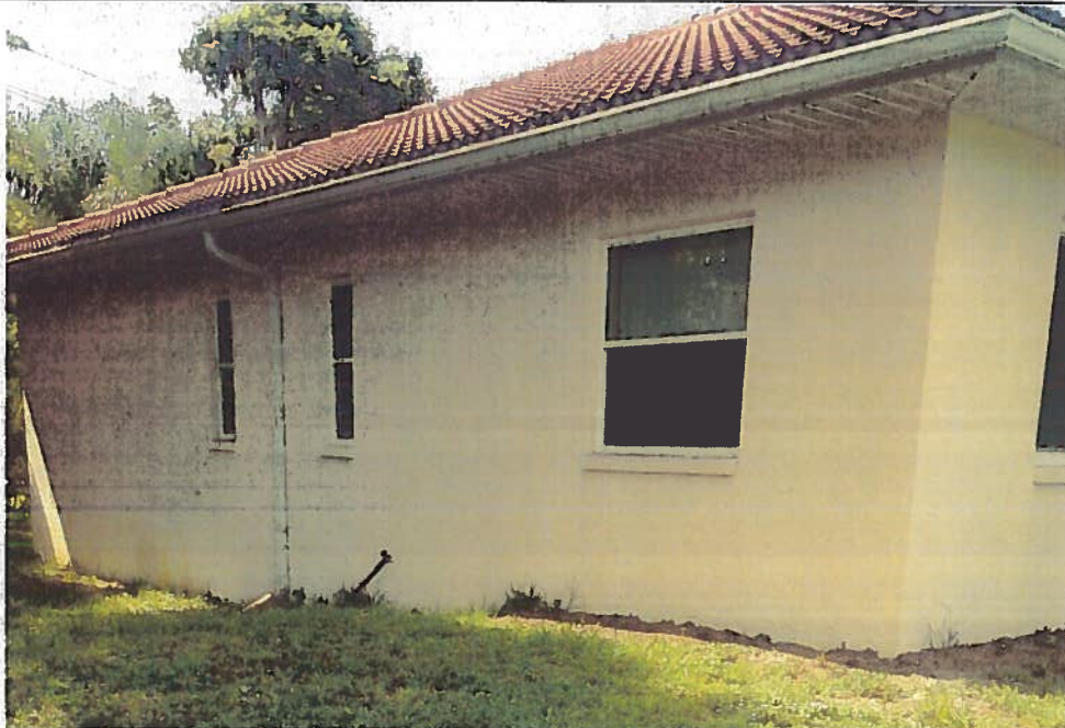
REAR VIEW 08-04-2020