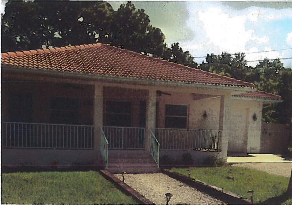
FRONT VIEW 08-04-2020

If using the Elevation Certificate to obtain NFIP flood insurance, affix at least 2 building photographs below according to the instructions for Item A6. Identify all photographs with date taken; "Front View" and "Rear View"; and, if required, "Right Side View" and "Left Side View." When applicable, photographs must show the foundation with representative examples of the flood openings or vents, as indicated in Section A8. If submitting more photographs than will fit on this page, use the Continuation Page.