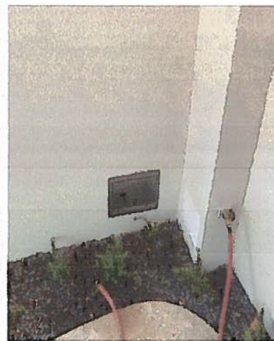
\ VENT \