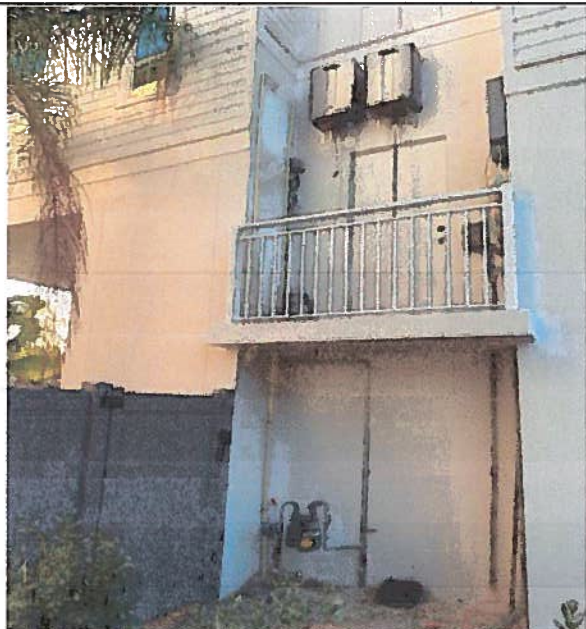
SIDE/ METER & WATER HEATERS

If submitting more photographs than will fit on the preceding page, affix the additional photographs below. Identify all photographs with: date taken; "Front View" and "Rear View"; and, if required, "Right Side View" and "Left Side View." When applicable, photographs must show the foundation with representative examples of the flood openings or vents, as indicated in Section A8.