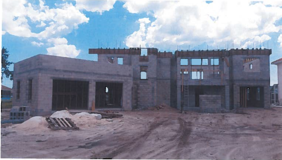
FRONT VIEW 5/27/15

If using the Elevation Certificate to obtain NFIP flood insurance, affix at least 2 building photographs below according to the instructions for Item A6. Identify all photographs with date taken; "Front View" and "Rear View"; and, if required, "Right Side View" and "Left Side View." When applicable, photographs must show the foundation with representative examples of the flood openings or vents, as indicated in Section A8. If submitting more photographs than will fit on this page, use the Continuation Page.