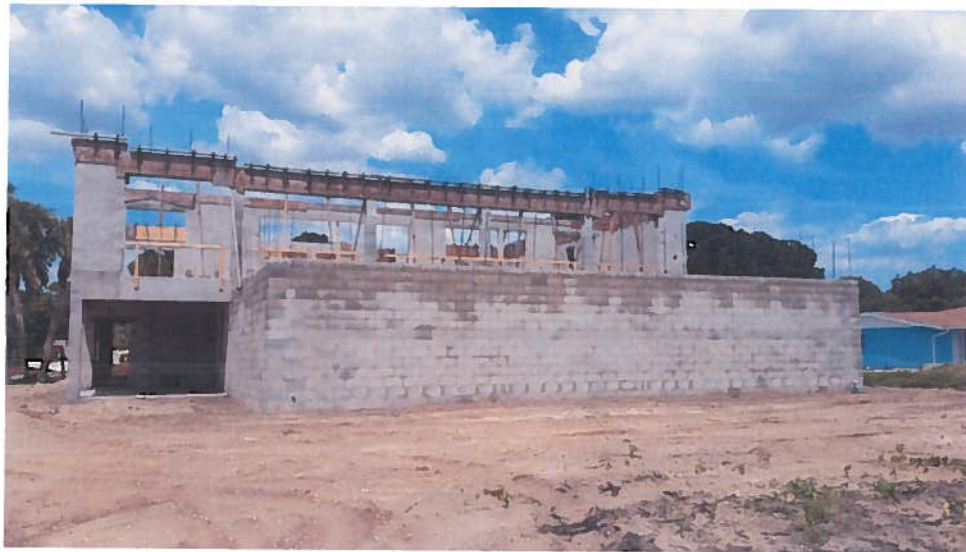
REAR VIEW 5/27/15