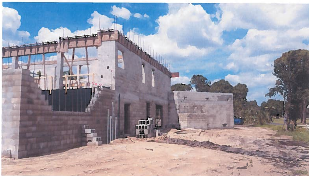
LEFT SIDE VIEW 5/27/15

If submitting more photographs than will fit on the preceding page, affix the additional photographs below. Identify all photographs with: date taken; "Front View" and "Rear View"; and, if required, "Right Side View" and "Left Side View." When applicable, photographs must show the foundation with representative examples of the flood openings or vents, as indicated in Section A8.