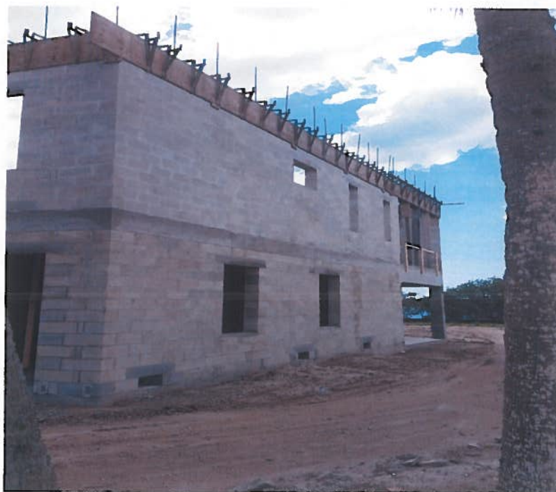
RIGHT SIDE VIEW 5/27/15