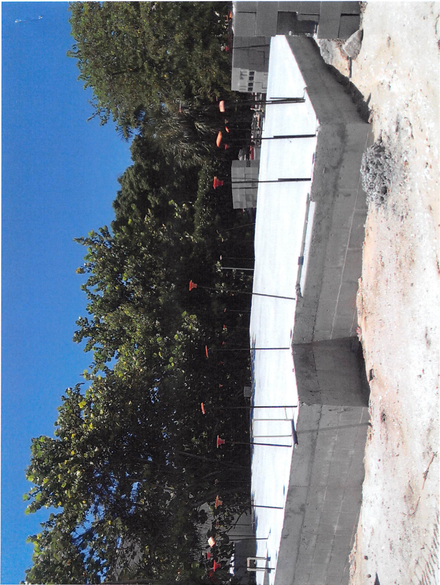
729 Manawatu Rear