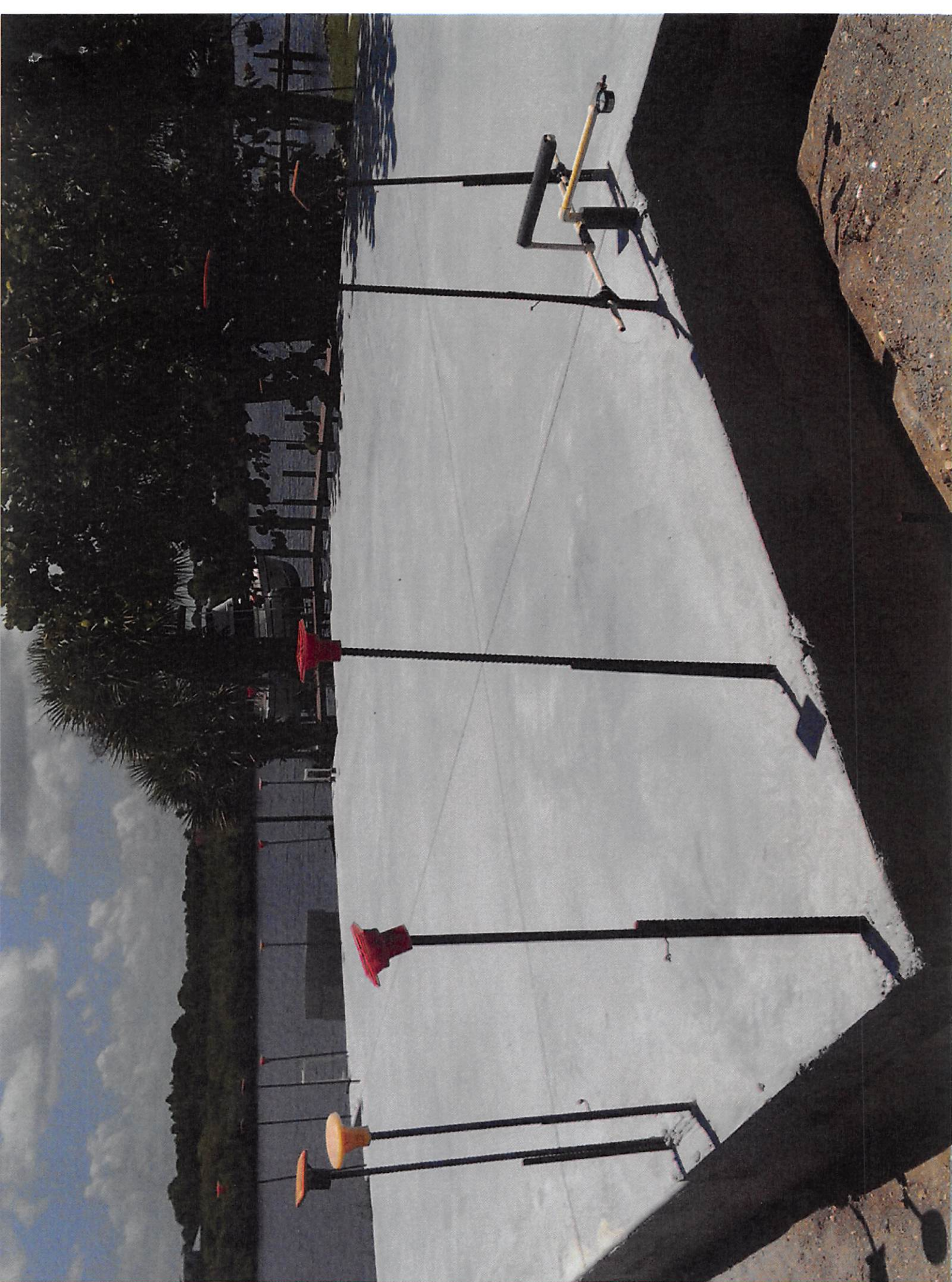
729 Manasota Front