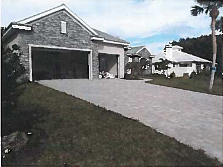
FRONT VIEW 12/22/15

If using the Elevation Certificate to obtain NFIP flood insurance, affix at least 2 building photographs below according to the instructions for Item A6. Identify all photographs with date taken; "Front View" and "Rear View"; and, if required, "Right Side View" and "Left Side View." When applicable, photographs must show the foundation with representative examples of the flood openings or vents, as indicated in Section A8. If submitting more photographs than will fit on this page, use the Continuation Page.