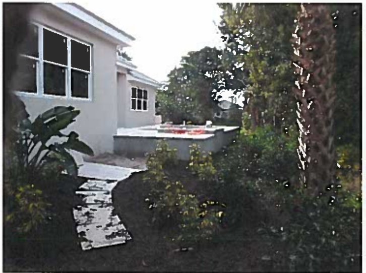
REAR VIEW 12/22/15