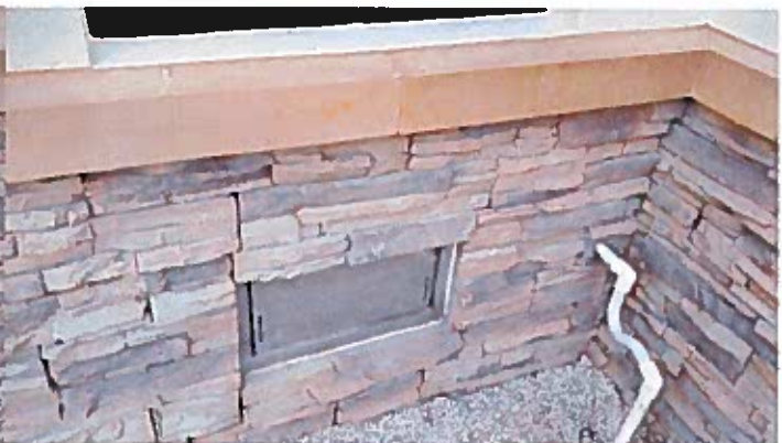
FLOOD VENT #7