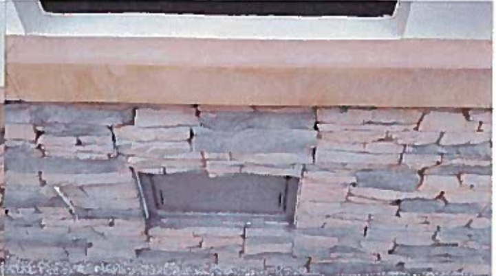
FLOOD VENT #5