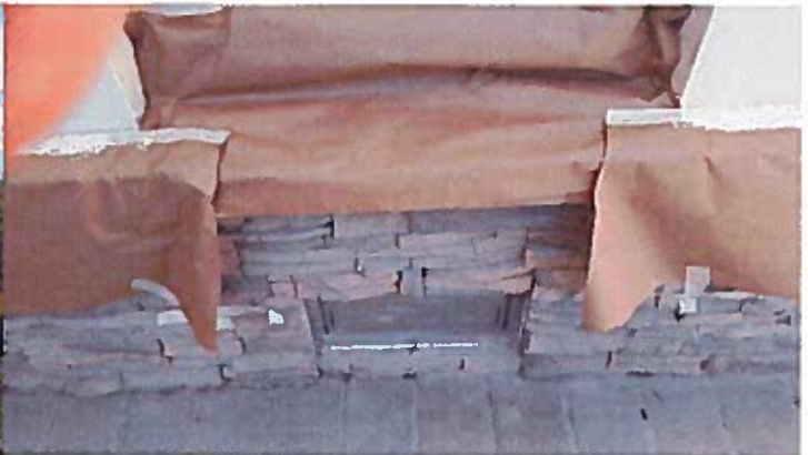
FLOOD VENT #1