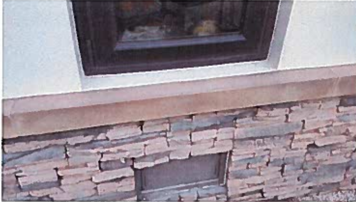
FLOOD VENT #4