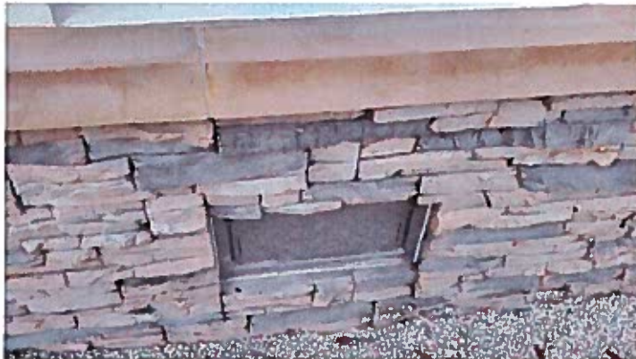
FLOOD VENT #6