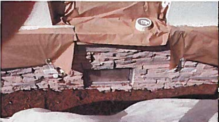
FLOOD VENT #2