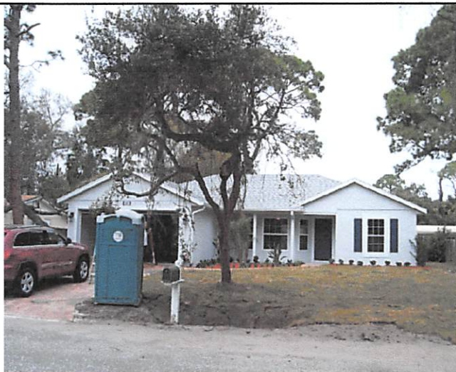
Front View 03/09/2016

If using the Elevation Certificate to obtain NFIP flood insurance, affix at least 2 building photographs below according to the instructions for Item A6. Identify all photographs with date taken; "Front View" and "Rear View"; and, if required, "Right Side View" and "Left Side View." When applicable, photographs must show the foundation with representative examples of the flood openings or vents, as indicated in Section A8. If submitting more photographs than will fit on this page, use the Continuation Page.