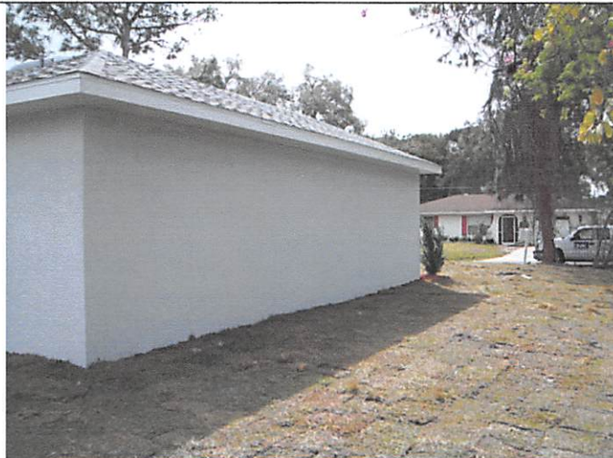
Side View 03/09/2016