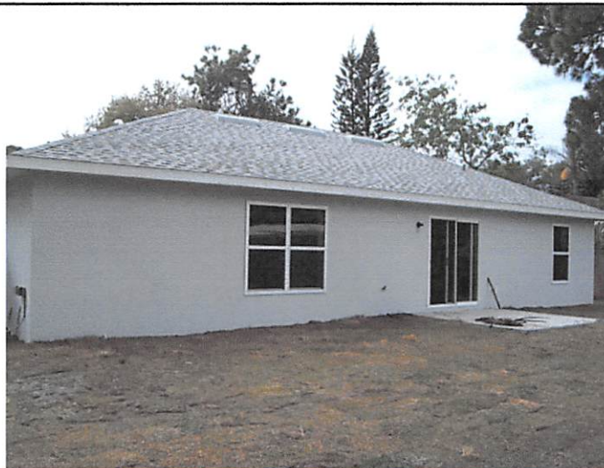
Rear View 03/09/2016