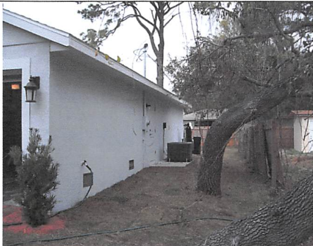
Side View 03/09/2016