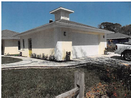
FRONT VIEW 4/5/16

If using the Elevation Certificate to obtain NFIP flood insurance, affix at least 2 building photographs below according to the instructions for Item A6. Identify all photographs with date taken; "Front view" and "Rear view"; and, if required, "Right Side View" and "Left Side View." When applicable, photographs must show the foundation with representative examples of the flood openings or vents, as indicated in Section A8. If submitting more photographs than will fit on this page, use the Continuation Page.