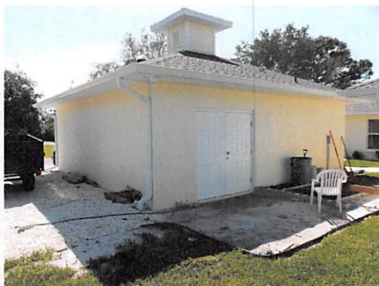
REAR VIEW 4/5/16