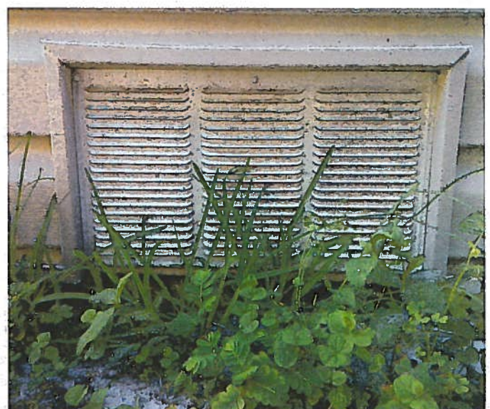
Flow Through Vent