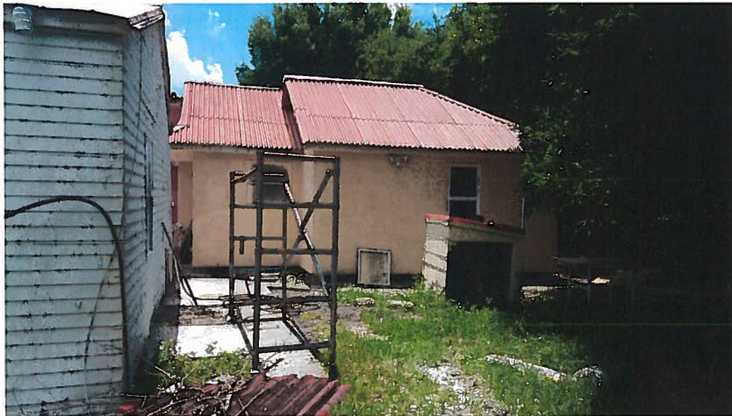
REAR VIEW 6/4/16