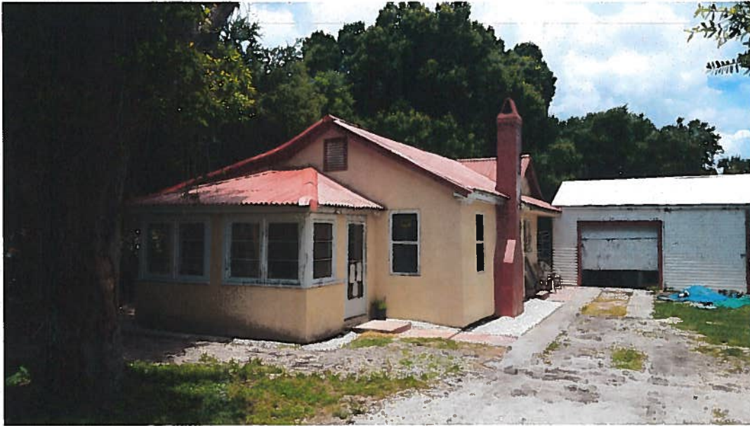
FRONT VIEW 6/4/16

If using the Elevation Certificate to obtain NFIP flood insurance, affix at least 2 building photographs below according to the instructions for Item A6. Identify all photographs with date taken; "Front view" and "Rear view"; and, if required, "Right Side View" and "Left Side View." When applicable, photographs must show the foundation with representative examples of the flood openings or vents, as indicated in Section A8. If submitting more photographs than will fit on this page, use the Continuation Page.