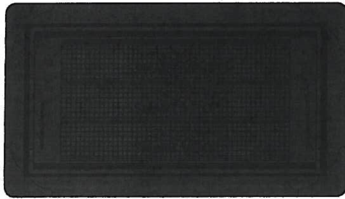
FIGURE 1—SMART VENT: MODEL 1540-510