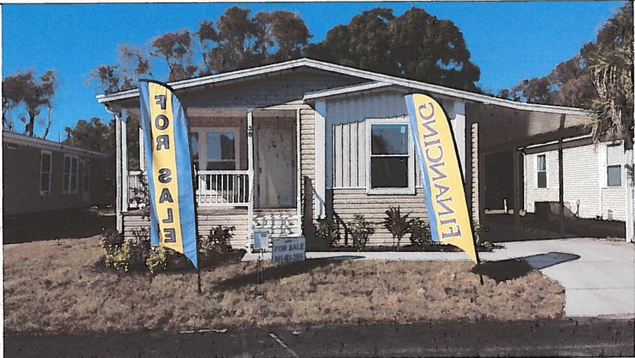
Photo One Caption Front

If using the Elevation Certificate to obtain NFIP flood insurance, affix at least 2 building photographs below according to the instructions for Item A6. Identify all photographs with date taken; "Front View" and "Rear View"; and, if required, "Right Side View" and "Left Side View." When applicable, photographs must show the foundation with representative examples of the flood openings or vents, as indicated in Section A8. If submitting more photographs than will fit on this page, use the Continuation Page.