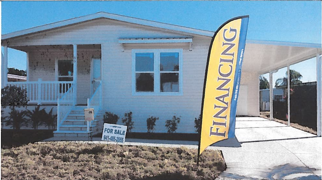
Photo One Caption Front

If using the Elevation Certificate to obtain NFIP flood insurance, affix at least 2 building photographs below according to the instructions for Item A6. Identify all photographs with date taken; "Front View" and "Rear View"; and, if required, "Right Side View" and "Left Side View." When applicable, photographs must show the foundation with representative examples of the flood openings or vents, as indicated in Section A8. If submitting more photographs than will fit on this page, use the Continuation Page.