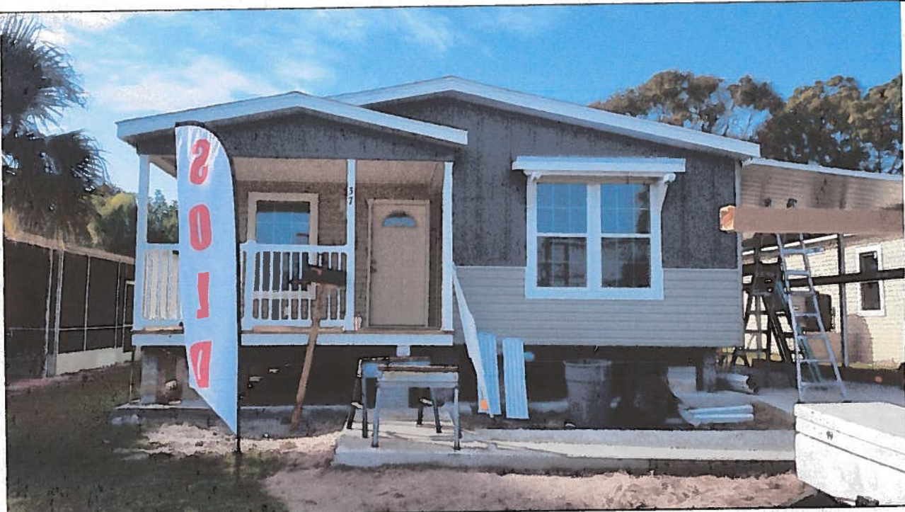
Photo One Caption Front

If using the Elevation Certificate to obtain NFIP flood insurance, affix at least 2 building photographs below according to the instructions for Item A6. Identify all photographs with date taken; "Front View" and "Rear View"; and, if required, "Right Side View" and "Left Side View." When applicable, photographs must show the foundation with representative examples of the flood openings or vents, as indicated in Section A8. If submitting more photographs than will fit on this page, use the Continuation Page.