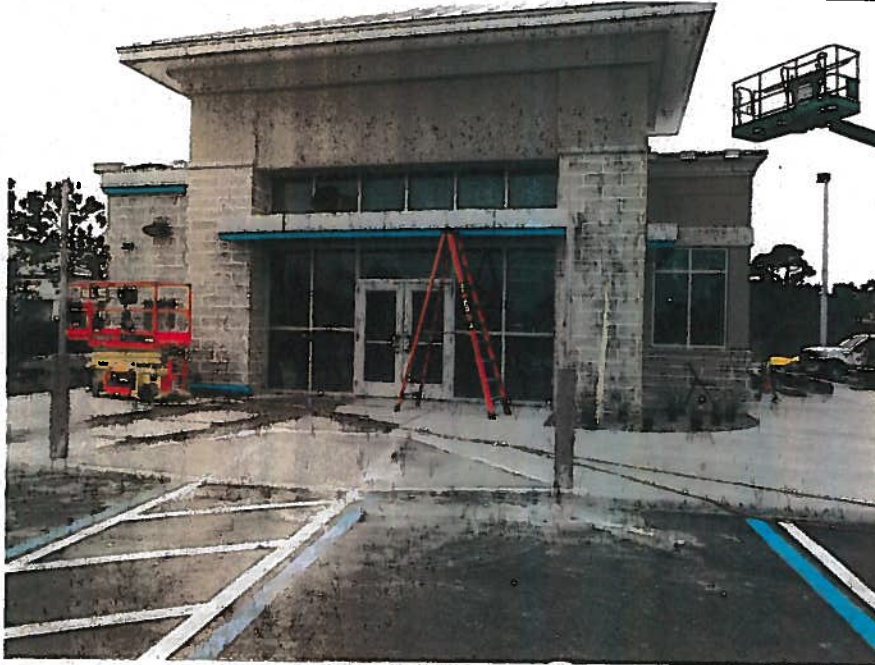
FRONT VIEW 11/30/16

If using the Elevation Certificate to obtain NFIP flood insurance, affix at least 2 building photographs below according to the instructions for Item A6. Identify all photographs with date taken; "Front View" and "Rear View"; and, if required, "Right Side View" and "Left Side View." When applicable, photographs must show the foundation with representative examples of the flood openings or vents, as indicated in Section A8. If submitting more photographs than will fit on this page, use the Continuation Page.