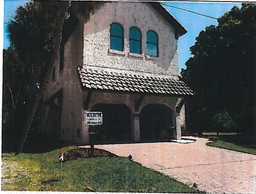
FRONT VIEW 05/05/17

If using the Elevation Certificate to obtain NFIP flood insurance, affix at least 2 building photographs below according to the instructions for Item A6. Identify all photographs with date taken; "Front View" and "Rear View"; and, if required, "Right Side View" and "Left Side View." When applicable, photographs must show the foundation with representative examples of the flood openings or vents, as indicated in Section A8. If submitting more photographs than will fit on this page, use the Continuation Page.