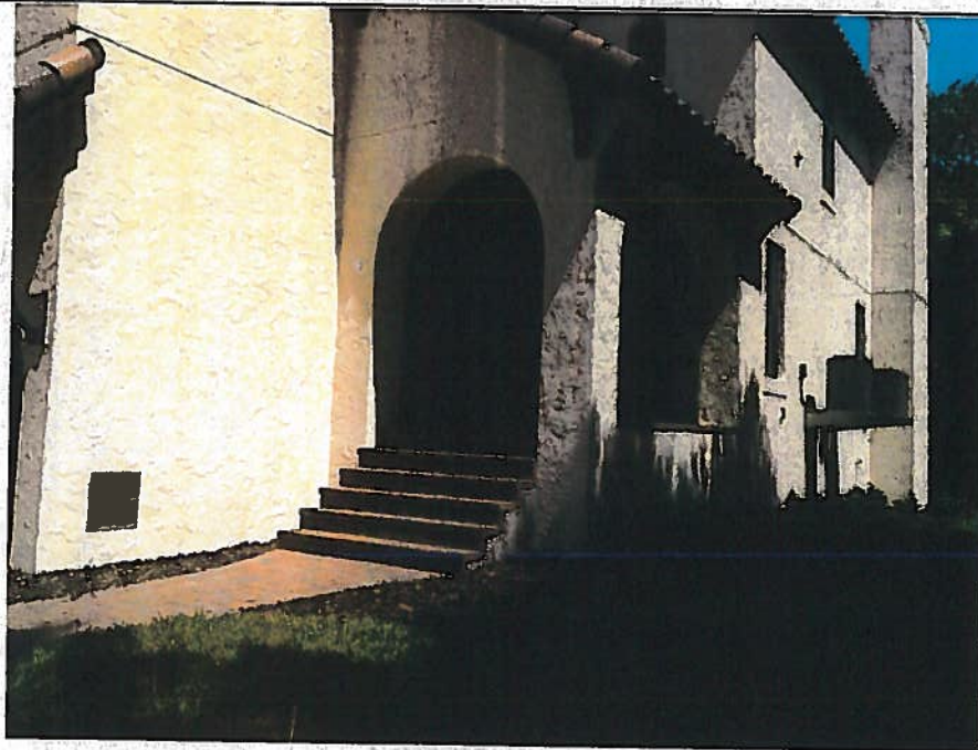
FRONT VIEW 05/05/17