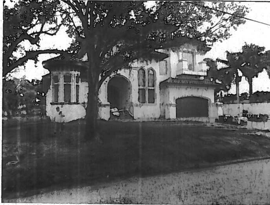
FRONT VIEW 03/31/2017

If using the Elevation Certificate to obtain NFIP flood insurance, affix at least 2 building photographs below according to the instructions for Item A6. Identify all photographs with date taken; "Front View" and "Rear View"; and, if required, "Right Side View" and "Left Side View." When applicable, photographs must show the foundation with representative examples of the flood openings or vents, as indicated in Section A8. If submitting more photographs than will fit on this page, use the Continuation Page.