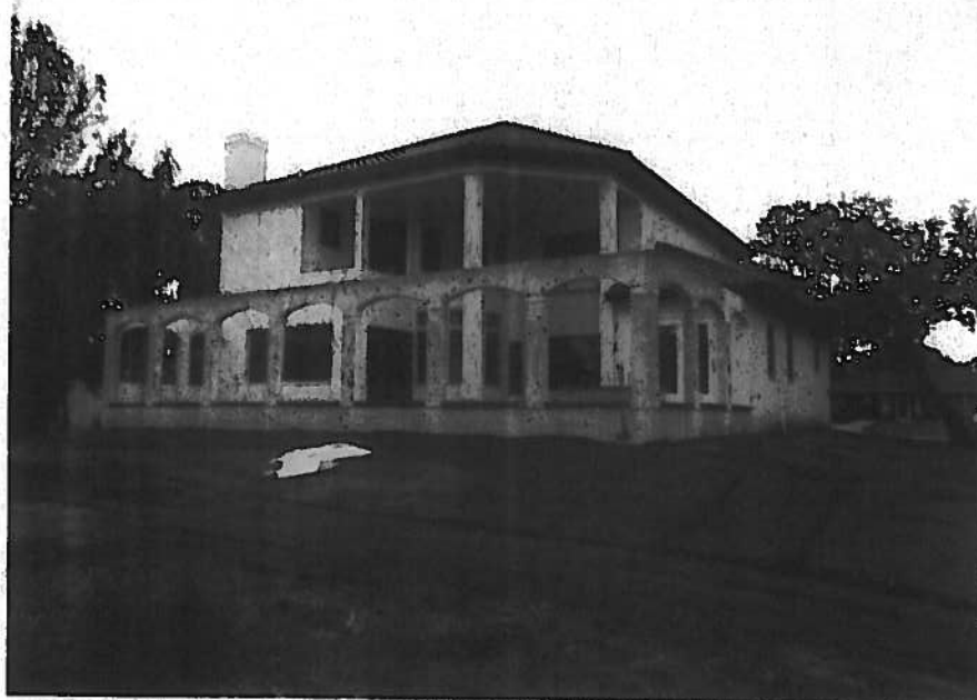
REAR VIEW 03/31/17