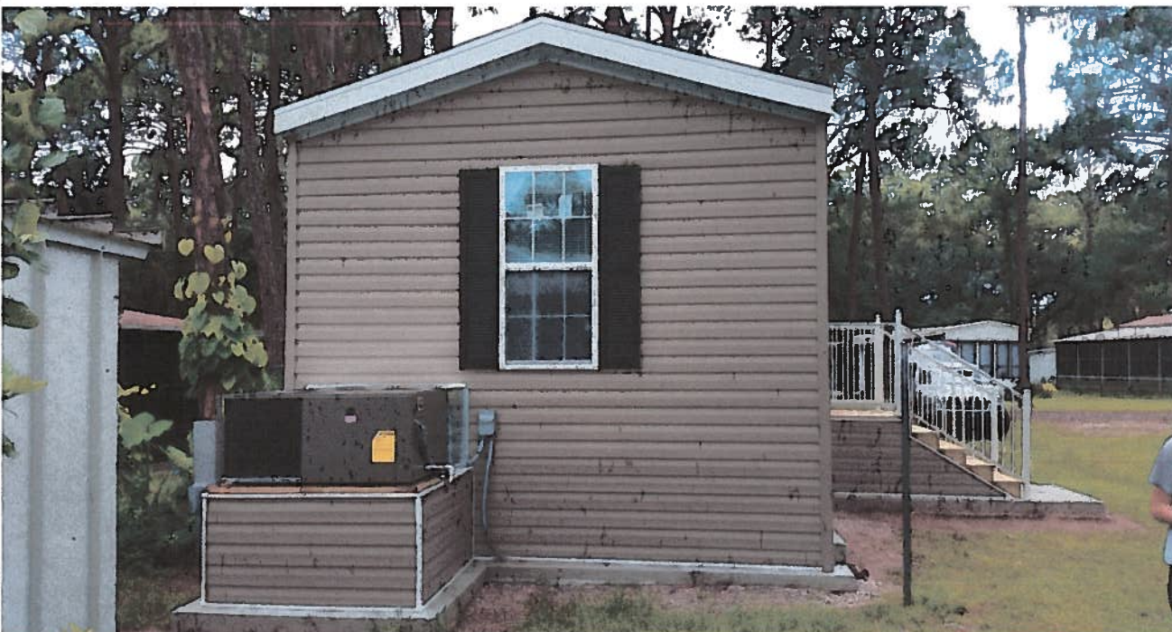
Photo Two Caption BACK