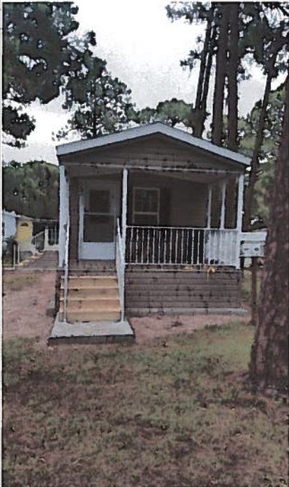
Photo One Caption FRONT

If using the Elevation Certificate to obtain NFIP flood insurance, affix at least 2 building photographs below according to the instructions for Item A6. Identify all photographs with date taken; "Front View" and "Rear View"; and, if required, "Right Side View" and "Left Side View." When applicable, photographs must show the foundation with representative examples of the flood openings or vents, as indicated in Section A8. If submitting more photographs than will fit on this page, use the Continuation Page.