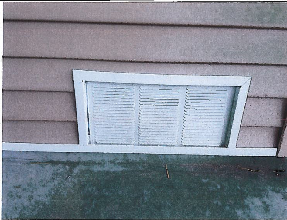
Photo Two Caption Two 8"x16" Flow Thru vents in Storage Bldg. Walls Date Taken 08/18/17 JOB# 16-1421