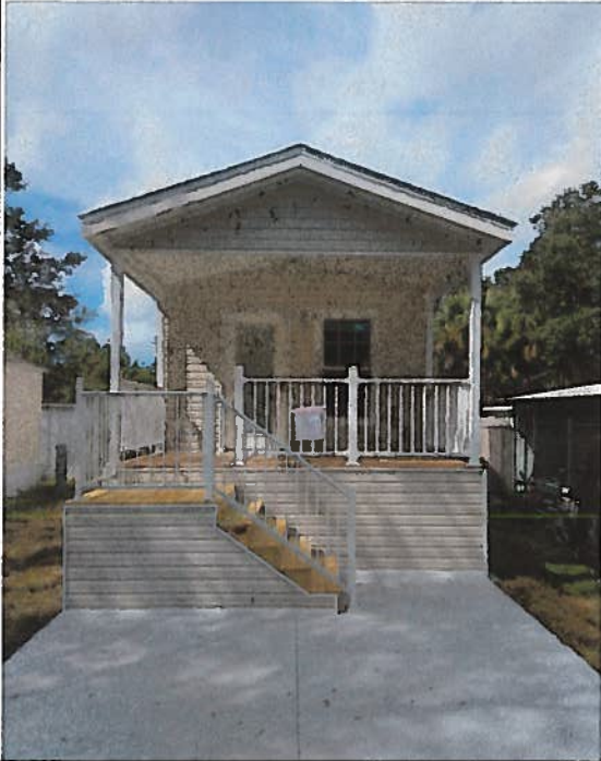
Photo One Caption FRONT

If using the Elevation Certificate to obtain NFIP flood insurance, affix at least 2 building photographs below according to the instructions for Item A6. Identify all photographs with date taken; "Front View" and "Rear View"; and, if required, "Right Side View" and "Left Side View." When applicable, photographs must show the foundation with representative examples of the flood openings or vents, as indicated in Section A8. If submitting more photographs than will fit on this page, use the Continuation Page.