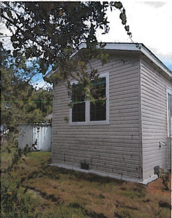
Photo Two Caption BACK