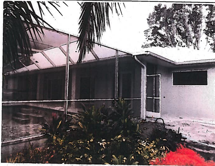
RIGHT REAR VIEW 11/06/17

If submitting more photographs than will fit on the preceding page, affix the additional photographs below. Identify all photographs with: date taken; "Front View" and "Rear View"; and, if required, "Right Side View" and "Left Side View." When applicable, photographs must show the foundation with representative examples of the flood openings or vents, as indicated in Section A8.