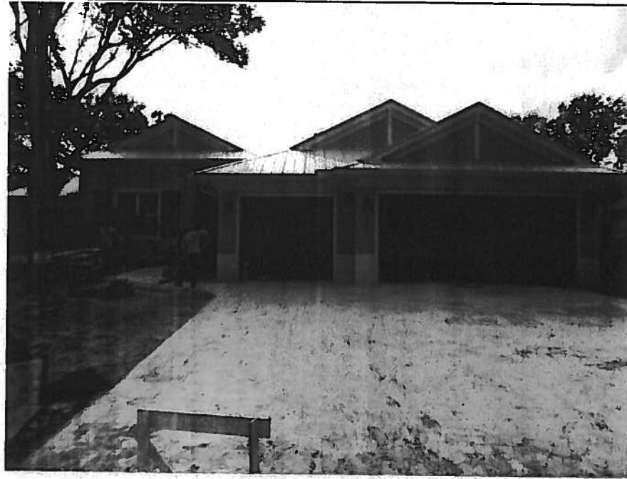
FRONT VIEW 11/06/17

If using the Elevation Certificate to obtain NFIP flood insurance, affix at least 2 building photographs below according to the instructions for Item A6. Identify all photographs with date taken; "Front View" and "Rear View"; and, if required, "Right Side View" and "Left Side View." When applicable, photographs must show the foundation with representative examples of the flood openings or vents, as indicated in Section A8. If submitting more photographs than will fit on this page, use the Continuation Page.